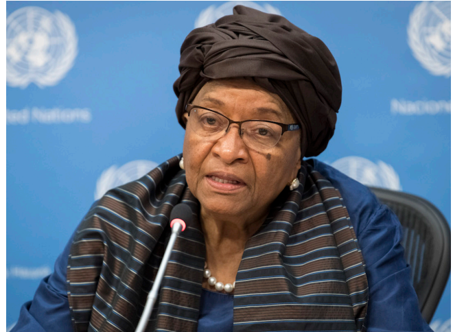
President Ellen Johnson Sirleaf of Liberia.

Demonstrable commitment to family planning strengthens the enabling environment in which programs and policies are implemented. Countries such as Indonesia, Mexico, and Turkey have longstanding commitments to family planning, as demonstrated