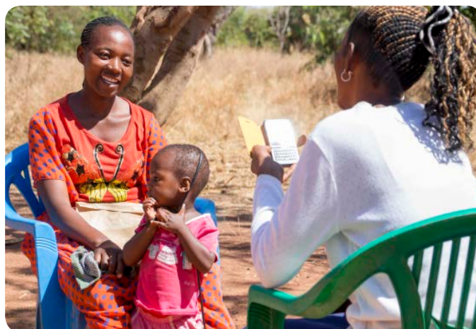
A community health worker uses D-tree International's mobile application to provide comprehensive family planning services to a client in Shinyanga, Tanzania.

Similar gains were reported in Bangladesh where an electronic LMIS collects data on consumption and availability of family planning commodities, sends SMS and email alerts for reporting reminders, tracks reports against set timelines, and sends warnings of potential stock imbalances for contraceptive commodities. Participant districts nearly eliminated stock-outs; for instance, facilities reporting stock-out rates for Implanon implants dropped from 69% to 1% among facilities using the digital system. 8