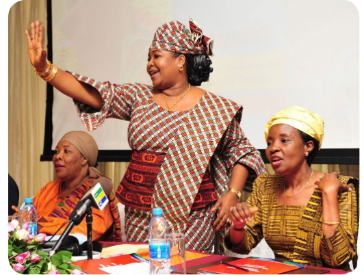
2012, Humphreys International Limited

Laws, regulations, codes, and policies affecting the operations of a health system range from those governing import duties and budget allocations, tenders, and purchases of contraceptives at ministerial levels to those influencing how health personnel at the primary care level spend their time and the quality of treatment clients receive at the facility level. Often, barriers to accessing high-quality health services have their roots in non-existent, inadequate, or conflicting policies (Cross et al., 2001). Tables 1-3 provide examples of three levels of policies from Asia, Latin America, and sub-Saharan Africa.