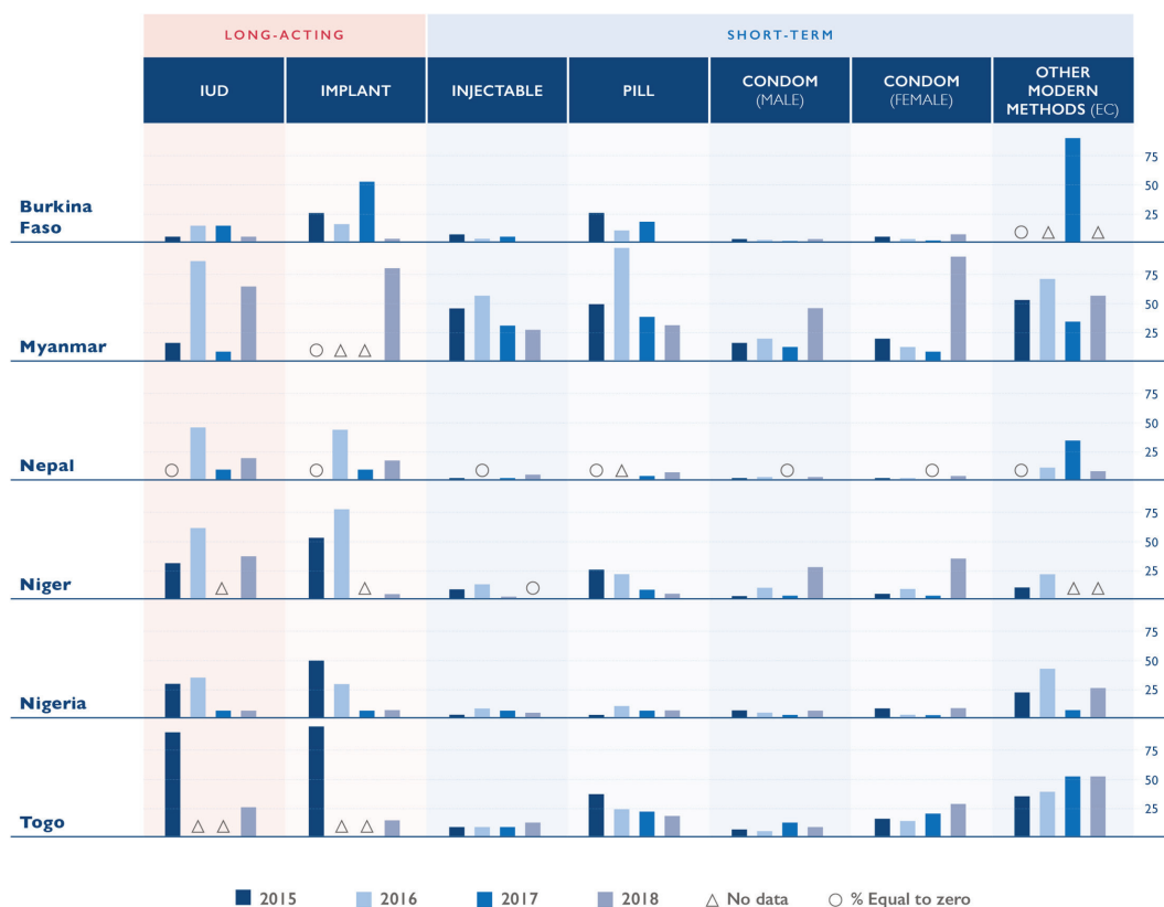
Figure 1: Percentage of facilities stocked out, by method offered, on the day of assessment

Supply chain management organizes the vast network of supply chain players—procurers, manufacturers, shippers, distributors, warehouse agents, facility managers, and service providers—in a system to ensure timely delivery of products from the port, to central and sub-national warehouses, and ultimately to service delivery points and