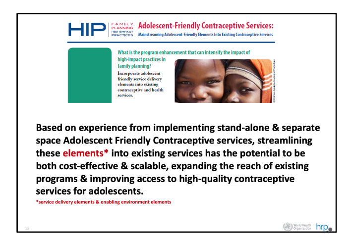
Figure 1. A slide from a WHO presentation

Participants also listed several specific examples of using the information from HIP products as resources for developing their own technical or country-specific briefs, strategy documents, or concept notes. For example, HIP products were used by World Health Organization (WHO) staff members in their "evidence-based advocacy work, capacity-building work, and country support work" and shared the presentation slides as examples (see below).