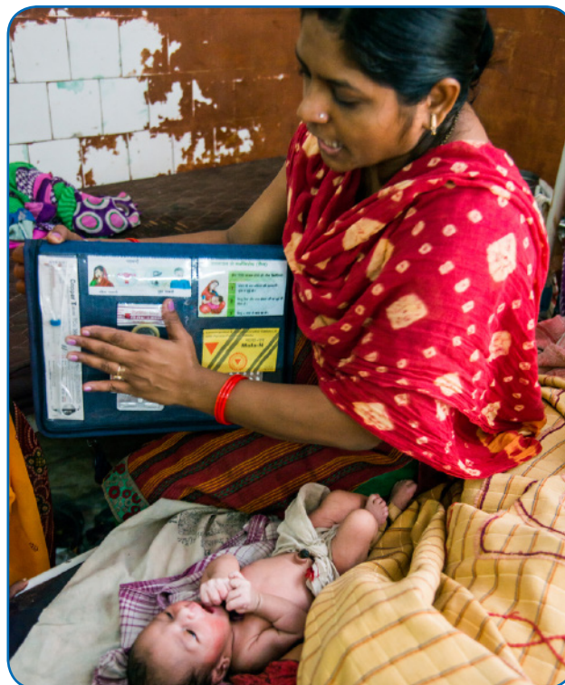
Mothers and their newborn children in the post natal ward at the district hospital in Arrah, Bihar.

Offering modern contraception services as part of care provided during childbirth increases postpartum contraceptive use and is likely to reduce both unintended pregnancies and pregnancies that are too closely spaced. 1,2 Unintended and closely spaced births are a public health concern as they are associated with increased maternal, newborn, and child morbidity and mortality. 3-5 After a live birth, the recommended interval before attempting the next pregnancy is at least 24 months, based on a consultation convened by the World Health Organization (WHO), in order to reduce the risk of adverse maternal, perinatal, and infant outcomes. 6 Despite this evidence, 61% of women are not using effective contraception within 24 months postpartum to avoid an unintended pregnancy. 7